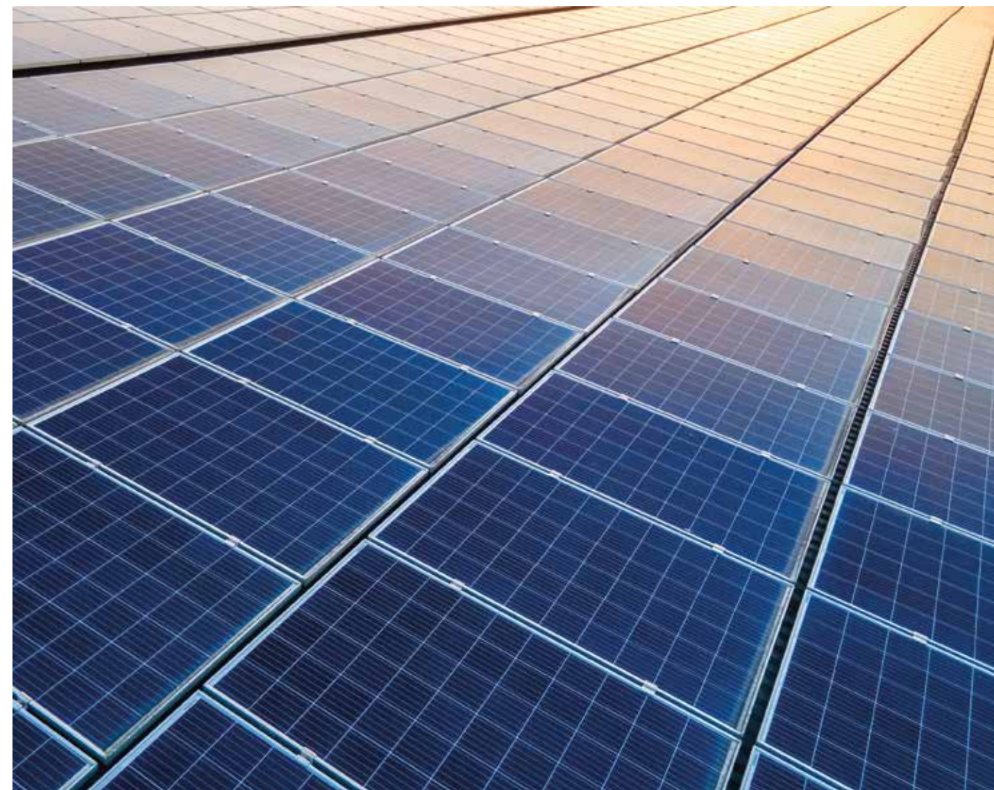
UK ENERGY GENERATION BY TECHNOLOGY 2024