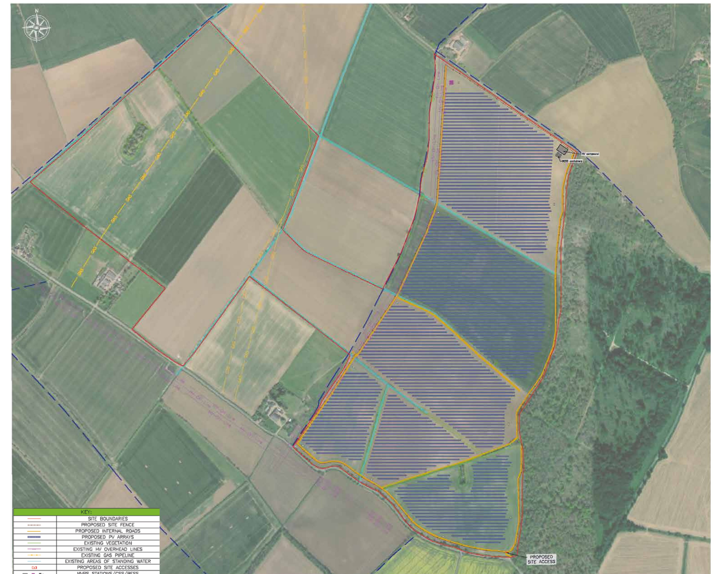
INDICATIVE LAYOUT PLAN